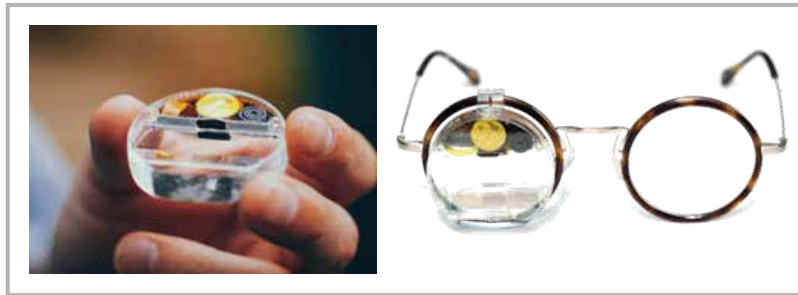
Monocle—Brilliant Labs’ first-generation product